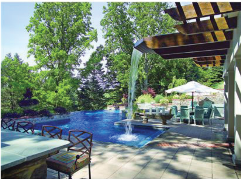
Water cascades through a trellis-style trough from the terrace's reflecting pool into the main pool below.

BY BRIDGET MCQUATE