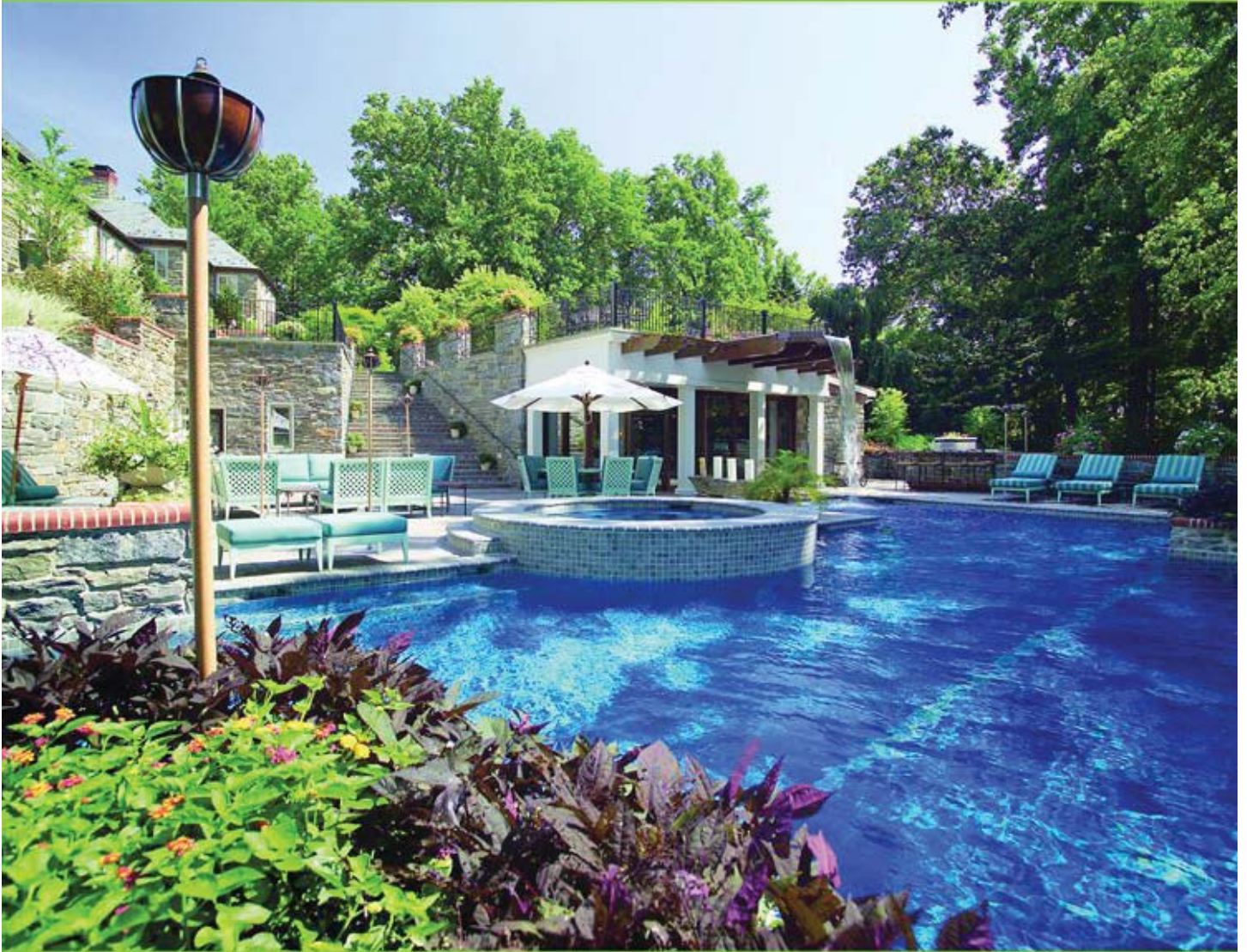
The pool house sits beneath a landscaped terrace and is surrounded by new stone walls that complement the look of the main house.